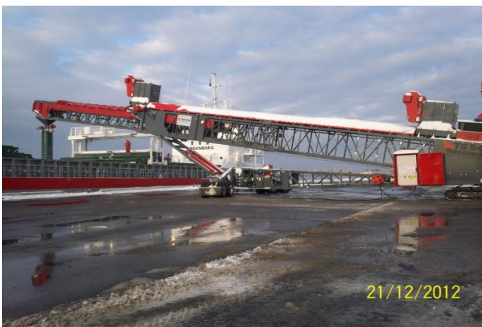
The Freefall Loading Chute is used to load fertilizers at rates of up to 500tph.

For further details on our innovative bulk material loading solutions please contact us by email, fax or telephone using the contact details shown above.