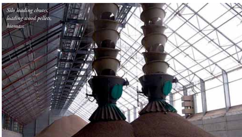
Silo loading chutes, loading wood pellets, biomass.

Wood pellets are also brittle and need careful handling to prevent material degradation during transportation. Poor handling equipment during transportation can not only damage the product but also create unwelcome air born dust pollution. When flowing, the material also carries some explosion risk and