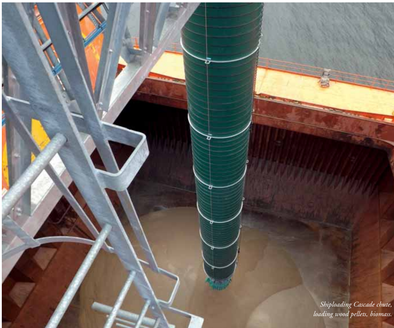
Shiploading Cascade chute, loading wood pellets, biomass.

In the global trend towards renewable energy sources, biomass has become a major sector and the volume of biomass material shipped internationally has grown exponentially. The number of biomass-fired power stations in the developed world has increased significantly, often at the expense of coal, as governments have adopted green energy policies and sought to hit their renewable energy targets.