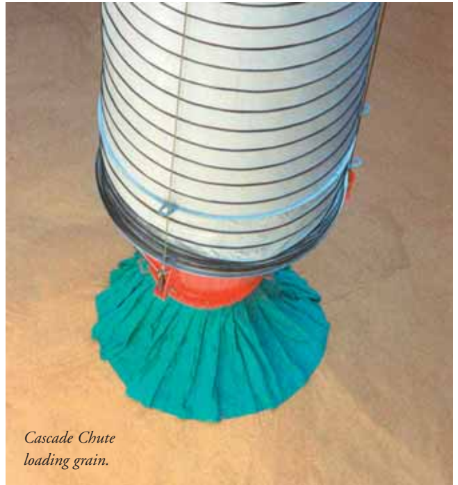
Cascade Chute loading grain.

A recent project in Turkey utilized the benefits of a Cascade shiploading chute. Iskar Muhendislik in Derince Port, installed an 18m chute capable of loading 1,200 tonnes of grain per hour. The running faces of the cones and head chute were lined with UWHMW polyethylene to provide a low friction abrasion resistant surface for the grain flow. The chute also includes an interchangeable outlet. The standard skirted arrangement can be alternated with a rotating trimmer device which directs the grain flow to corners of the ships hold.